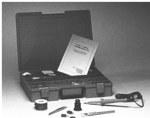
SK-2, Sensor Kit

Model SK-2 All materials, tools and instructions for making interchangeable Type T (copper-constantan) thermocouple sensors.